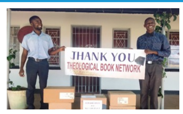
"Thank You" from our partners in Zimbabwe!

Book donation questions? Contact us at info@tbn.global